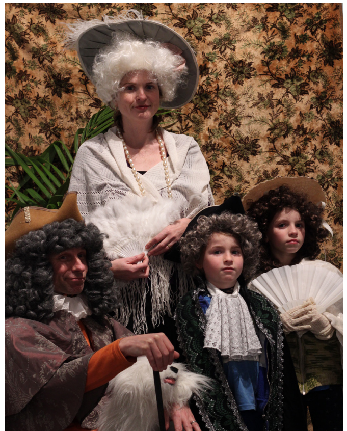
A fun family portrait from our 18th Century Photobooth.