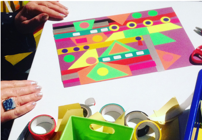
A visitor creates an artwork in the Leitmotif activity table using tape, paper and stickers.