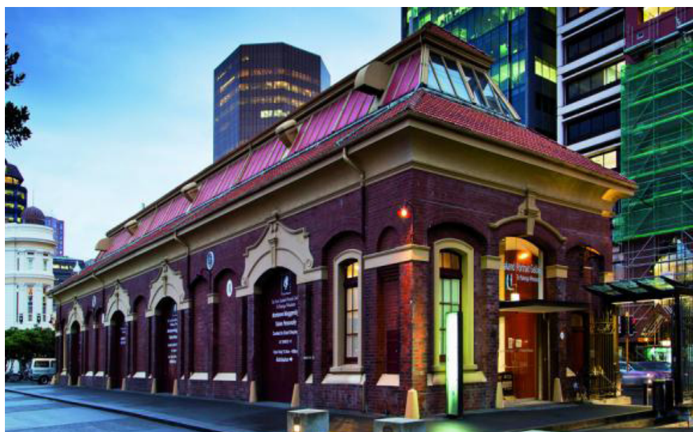
The New Zealand Portrait Gallery, Shed 11