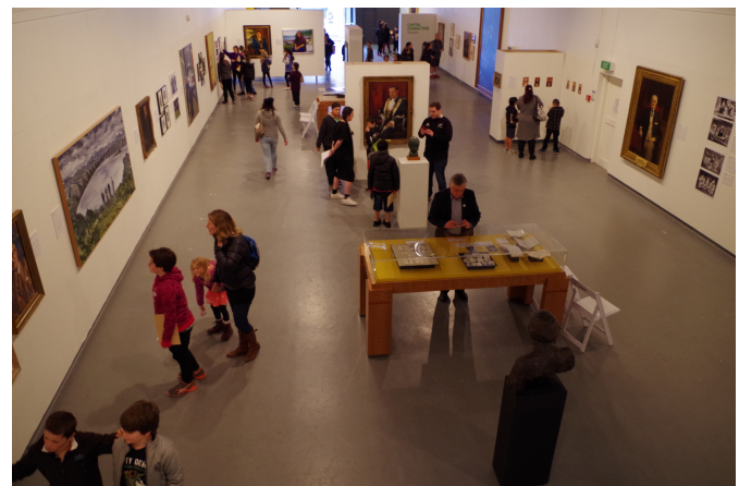
Visitors at Capital Characters during the Capital 150, Open House Weekend

The New Zealand Portrait Gallery was able to develop, promote and mount this well received exhibition with the kind support of both The Lion Foundation and Pub Charity Ltd.