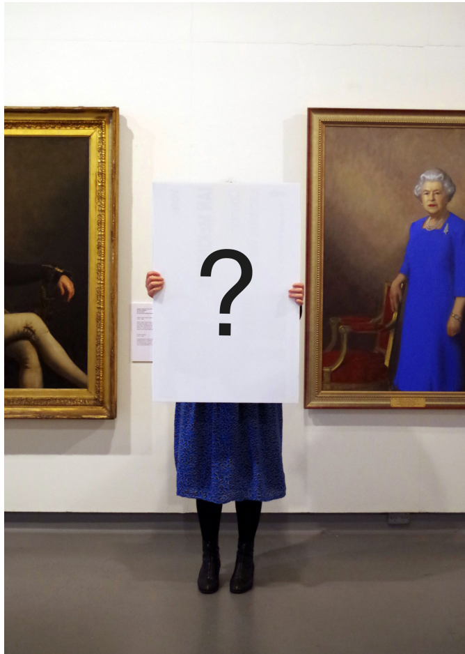
Promotional Image for Who's Missing?

In 2015 we were pleased to add a new donor, Guild Holdings, which has pledged contributions of $20,000 a year for five years. Guild joins the Freemasons Foundation as one of our cornerstone donors.