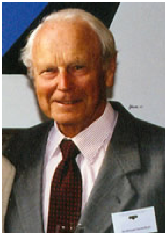
Rt Hon Sir Michael Hardie Boys, GNZM, GCMG, QSO.