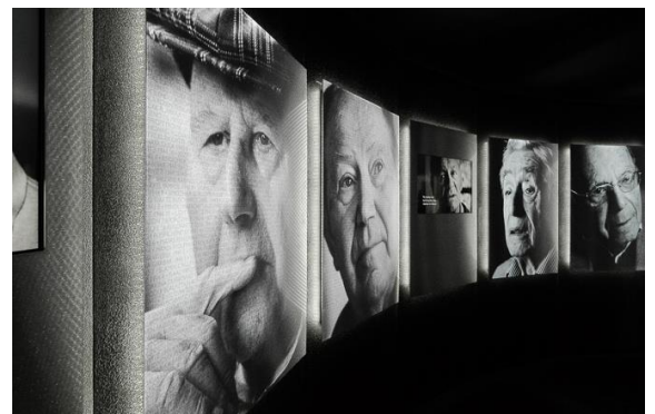
Images from the Shadows of Shoah Exhibition

FORM - A graduate exhibition from Wellington Institute of Technology